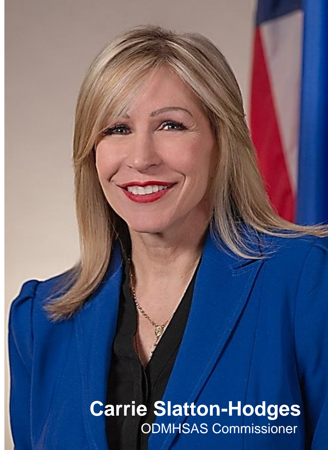
Carrie Slatton-Hodges ODMHSAS Commissioner