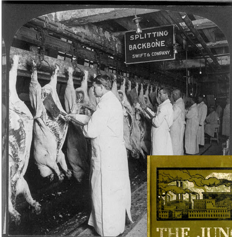
265 Splitting backbones and final inspection cooler, Swift & Co., Chicago, U.S.A. c.

What are some of the historical precedents that make Good Manufacturing Practices (GMPs) and Process Validation so critical?